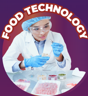
Silk as an Edible Film & Indicator