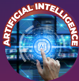
Personal Agentic Assistant