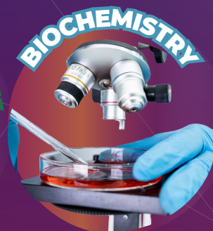
Plant Based Protein Extraction and Analysis